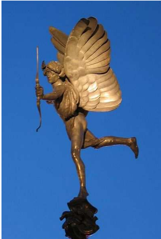
Anteros by Alfred Gilbert , 1893; from the Shaftesbury Memorial in Piccadilly Circus

Piccadilly Circus is a road junction and public space of London's West End in the City of Westminster, built in 1819 to connect Regent Street with the major shopping street of Piccadilly. In this context, a circus, from the Latin word meaning "circle", is a round open space at a street junction.